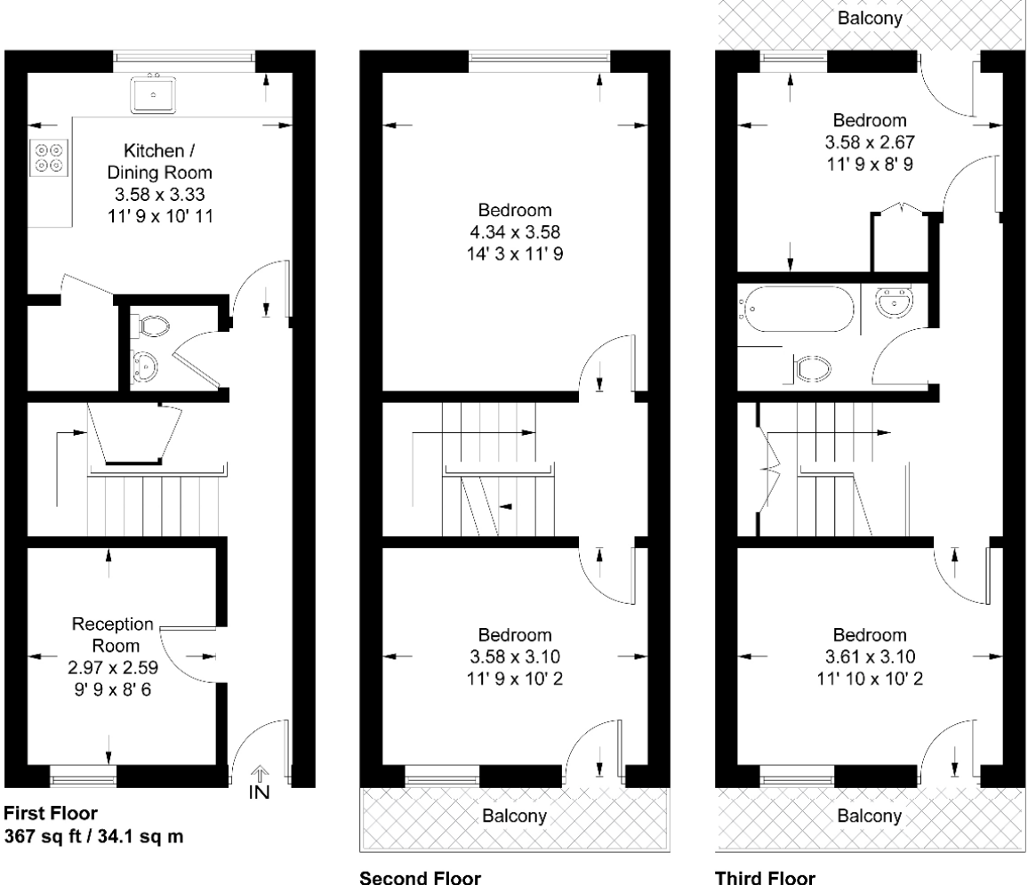
367 sq ft / 34.1 sq m

Approximate Gross Internal Area = 1103 sq ft / 102.5 sq m